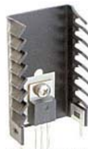
Representative Photo Only