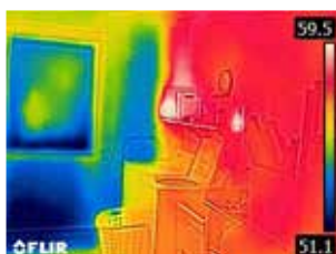
Uninsulated outside wall