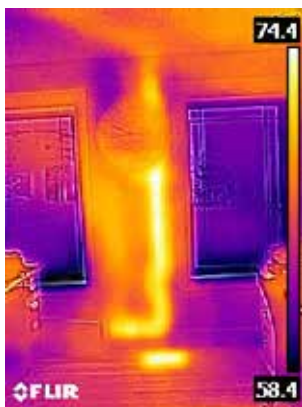
Warm drain pipe in wall