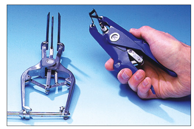
Fast, secure application with the three-pronged expansion tools.