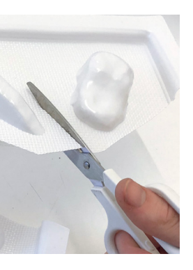
t away the excess around the car a pair of scissors.