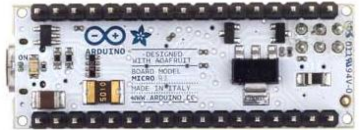
Arduino Micro Rear