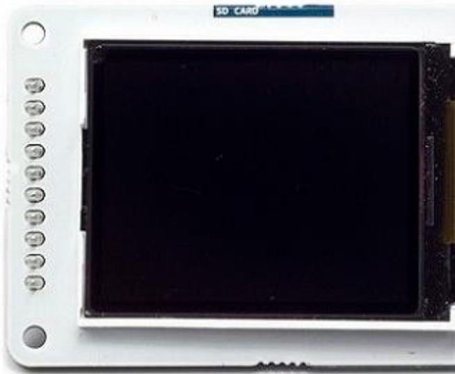
Arduino Graphic TFT Front