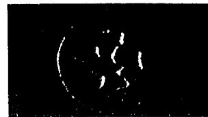
Competitors' imitation 5-core solder

Flux-cored solder wire is universally made by an extrusion process followed by drawing through dies progressively reducing the wire diameter from say 16 mm to the required diameter which is normally in the range 3 mm to 0.2 mm. As solder is opaque and usually contains lead it is not possible to see and test inside the wire to check for flux presence. The extrusion process is subject to variations of pressure and temperature which can lead to occasional blockages or contractions of the flux core. The shortest of such a flux void at the extrusion stage results in a much longer length without flux in the drawn down wire. Any gap in the flux continuity will result in a "dry" faulty joint. Solder cannot join metals without flux.