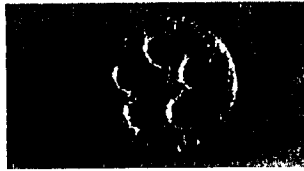
Ersin Multicore 5-core solder