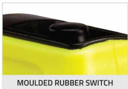
MOULDED RUBBER SWITCH