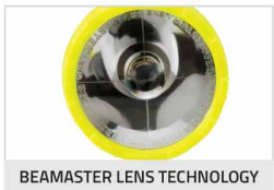
BEAMASTER LENS TECHNOLOGY