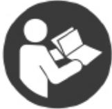
Refer to instruction manual

IMPORTANT: PLEASE READ THESE INSTRUCTIONS CAREFULLY. NOTE THE SAFE OPERATIONAL REQUIREMENTS, WARNINGS & CAUTIONS. USE THE PRODUCT CORRECTLY AND WITH CARE FOR THE PURPOSE FOR WHICH IT IS INTENDED. FAILURE TO DO SO MAY CAUSE DAMAGE AND/OR PERSONAL INJURY AND WILL INVALIDATE THE WARRANTY. KEEP THESE INSTRUCTIONS SAFE FOR FUTURE USE.