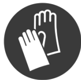
Wear protective gloves