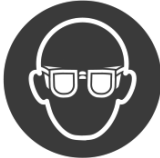
Wear eye protection