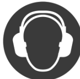
Wear ear protection