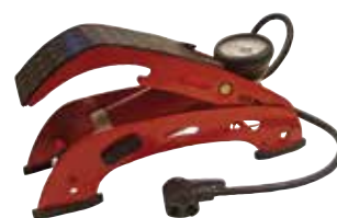
Foot Pump Single Cylinder with Gauge