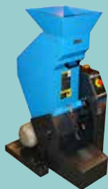
SCHRED PLASTIC RECYCLING SYSTEM