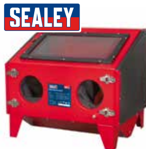
Shot Blasting Cabinet Double Access 690 x 575 x 620mm