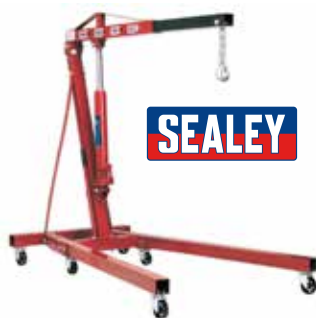
Folding Engine Crane Yankee 1.8tonne