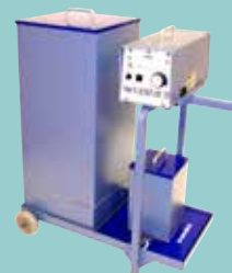
DIP COATING SYSTEM

Visit www.rapidonline.com/brands/c-r-clarke for the full range.