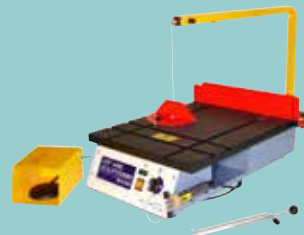
HOT WIRE SCULPTORS