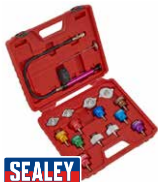
Radiator Pressure Test Kit