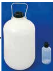
Price each - MOQ 4

For technical specialisation visit www.rapidonline.com