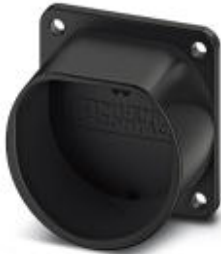
Retainer for Vehicle Connector as parking position at charging stations (EVSE), Type 2, IEC 62196-2

Please be informed that the data shown in this PDF Document is generated from our Online Catalog. Please find the complete data in the user's documentation. Our General Terms of Use for Downloads are valid ( http://download.phoenixcontact.com )