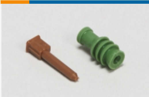
Automotive Seals & Cavity Plugs (26)