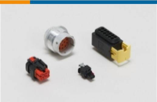
Automotive Housings (498)