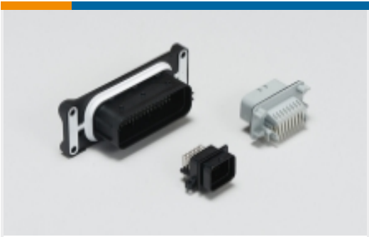
Automotive Headers (207)