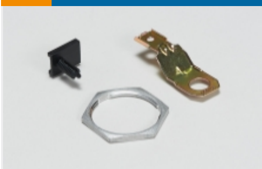
Other Automotive Connector Accessories (13)