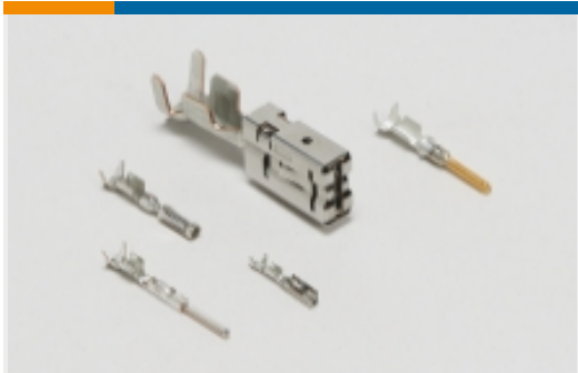
Automotive Terminals (98)