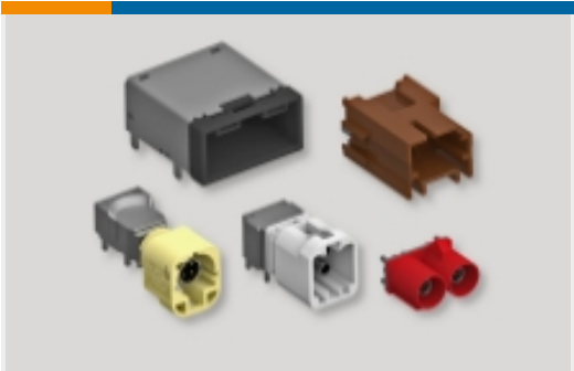
Data Connectivity Headers (1)