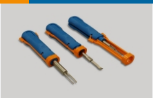
Insertion & Extraction Tools (42)