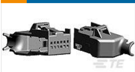
TE Part #1-1534096-1 MQS ABDECKKAPPE2X6P