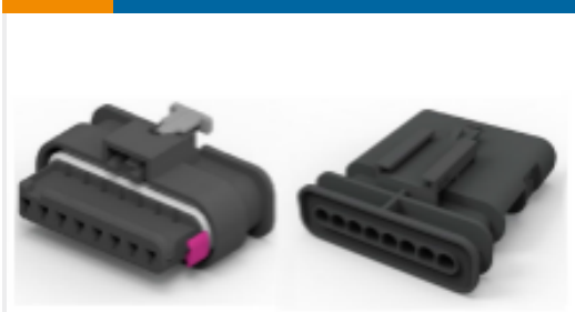
TE Part #1-1670917-1 MCON, CONNECTOR HOUSING