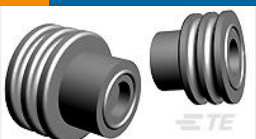
TE Part #1394512-1 EINZELLEITDICHTG,BL