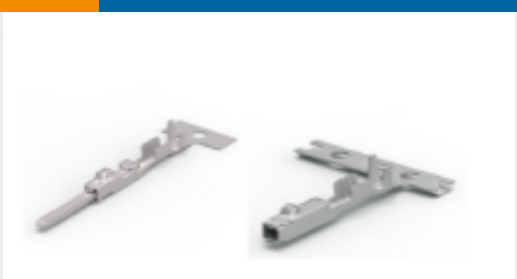
TE Part #1-2177909-1 MCON, RECEPTACLE AND TAB