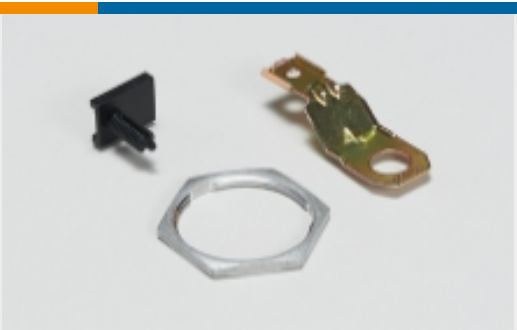
Other Automotive Connector Accessories(6)