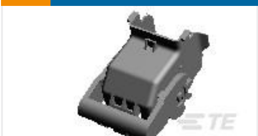
TE Part #1452416-1 58POS CONNECTOR COVER 180 ASSY