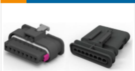
TE Part #1-2141324-1 MCON, CONNECTOR HOUSING