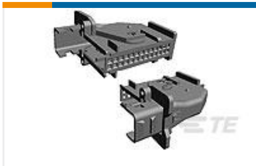
TE Part #144934-2 SHIELD MQS 26P ASS'Y