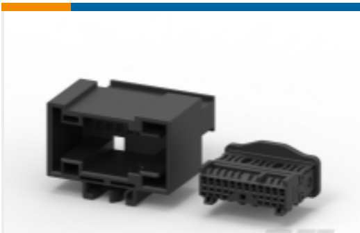
TE Part #1-968636-2 MQS, CONNECTOR HOUSING