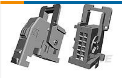
TE Part #1379096-3 COV+LEV MQS 12W 90DEG BLK