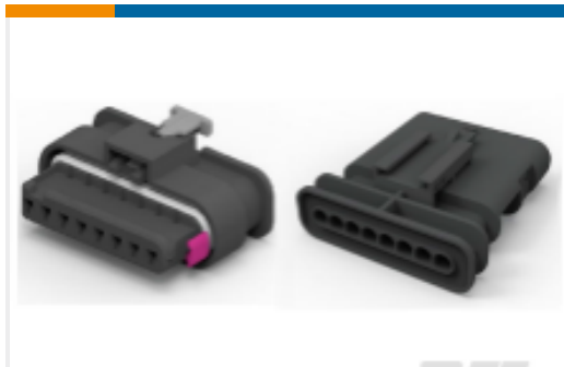
TE Part #1-2236343-5 MCON, CONNECTOR HOUSING