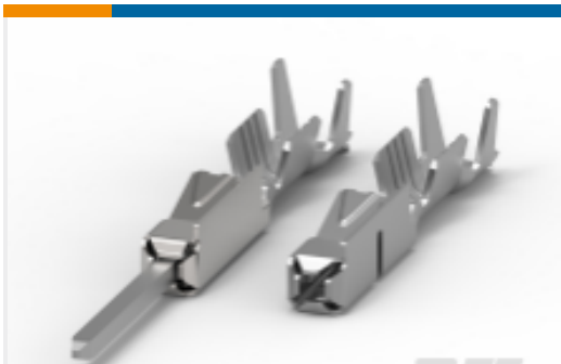
TE Part #144969-1 MQS, RECEPTACLE AND TAB