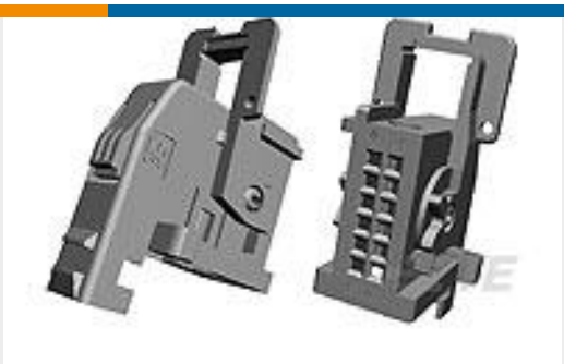
TE Part #1379096-2 COV+LEV MQS 12W 90DEG BLU