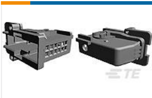
TE Part #1379095-3 COV+LEV MQS 12W 0DEG BLAC