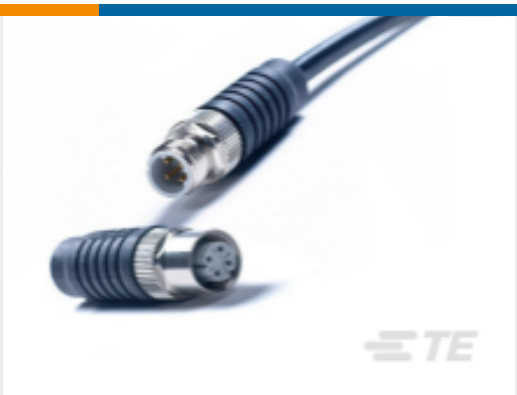
TE Part #1-2315715-1 M12 STRAIGHT CRIMPED STRAIN RELIEF