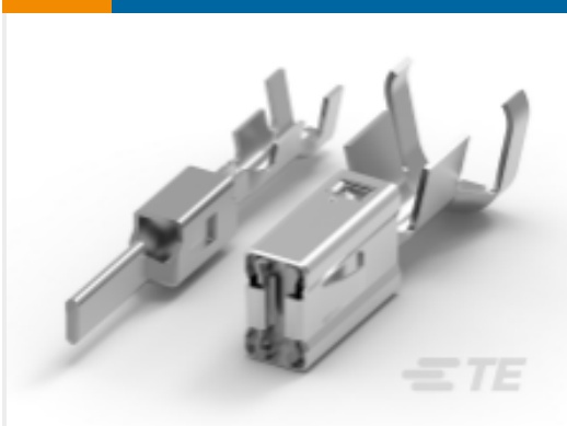
TE Part #1241414-3 AMP MCP, RECEPTACLE AND TAB