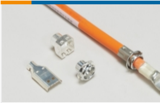
Automotive Connector EMC Shielding (2)