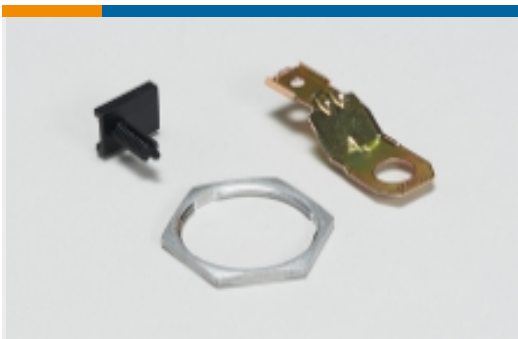
Other Automotive Connector Accessories(13)