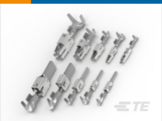
TE Part #1-962919-2 TIMER, RECEPTACLE AND TAB