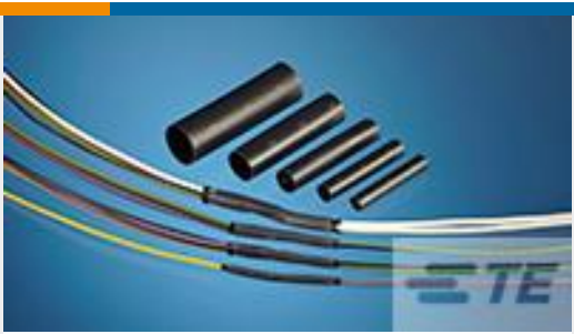
TE Part #CH03026001 QSZH-125-NR3A-65MM