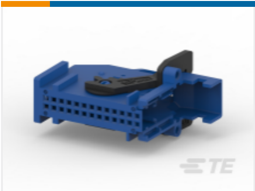
TE Part #1-185879-2 26W MQS COVER ASSY BLUE