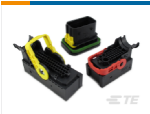
TE Part #1-1823440-2 LEAVYSEAL HOUSINGS