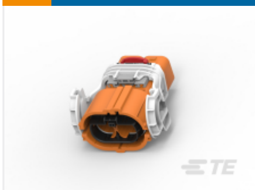
TE Part #1-2177053-4 2POS,8MM HV,PLUG HSG,ASSY, SEALED