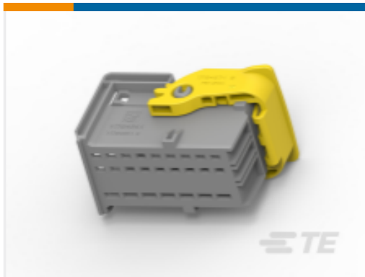
TE Part #1-2141846-2 AMP MCP BACKSHELLS