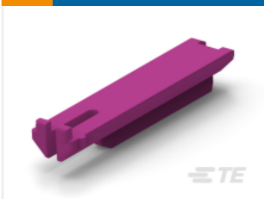
TE Part #1-1355034-1 JPT KONTSICHERUNG8P