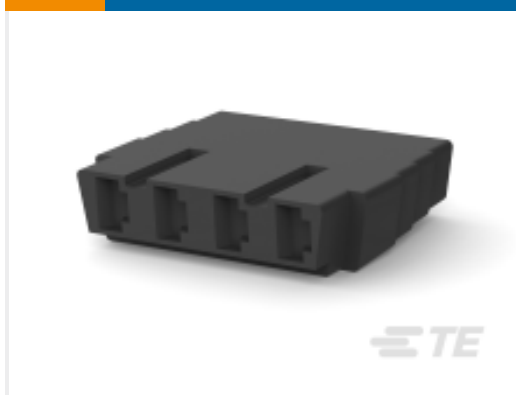
TE Part # 926728-1 FF 110 REC HSG 4P NYLON BLACK