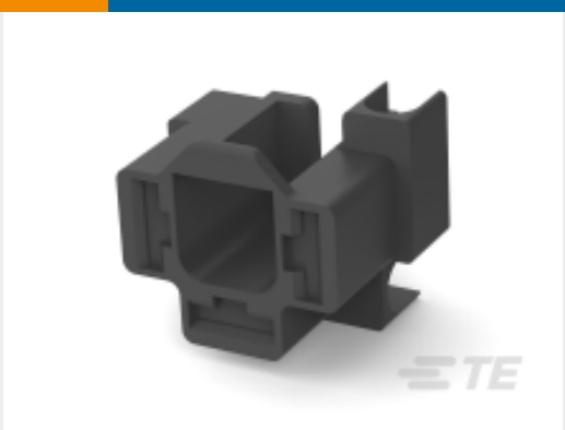
TE Part # 150653-1 FF 312 REC HSG 3P NYLON BLACK