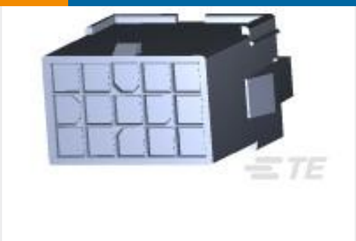
TE Part #172163-1 15 CIR UNIV M-N-L CAP