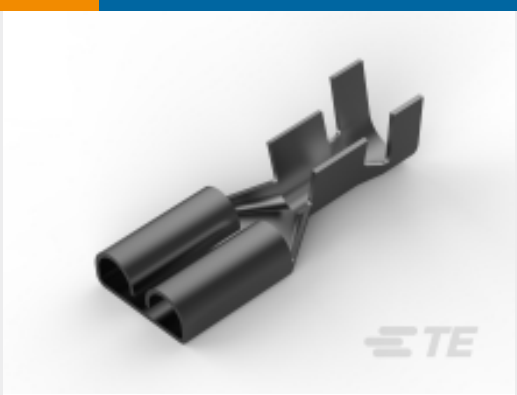
TE Part # 170258-2 FF 250 REC 14-12AWG TPBR REREELING