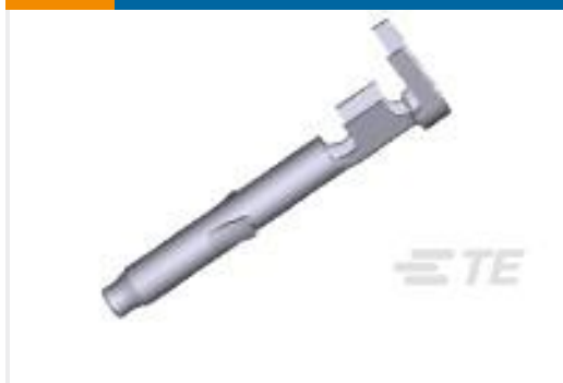
TE Part #170362-1 UNIV M-N-L SOC. 22-18 AWG