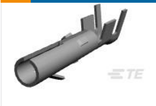
TE Part #163302-6 MATENLOK SIDE WAY