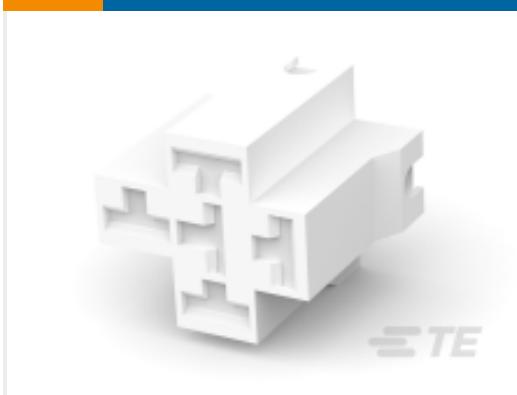
TE Part # 1-626040-0 RELY BASE MOLDING 5W POLYPROPYLENE