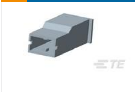
TE Part #154719 250 HSG. PL MKI REC. BLACK