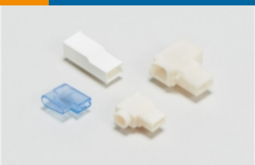
Crimp Terminal Housings(216)