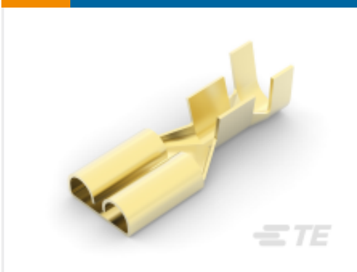
TE Part # 170258-1 FF 250 REC 14-12AWG BR REREELING