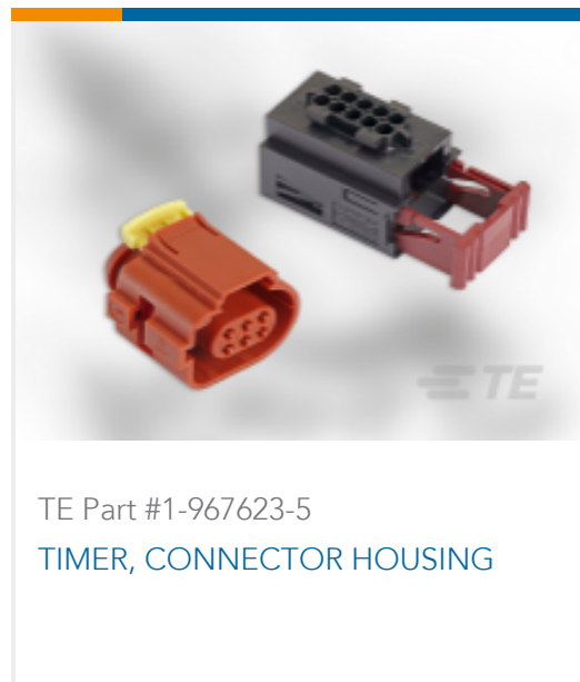
TE Part #1-967623-5 TIMER, CONNECTOR HOUSING