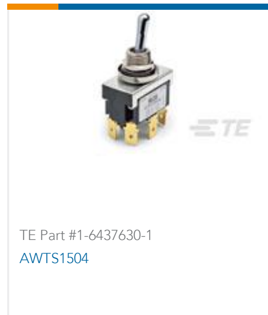
TE Part #1-6437630-1 AWTS1504