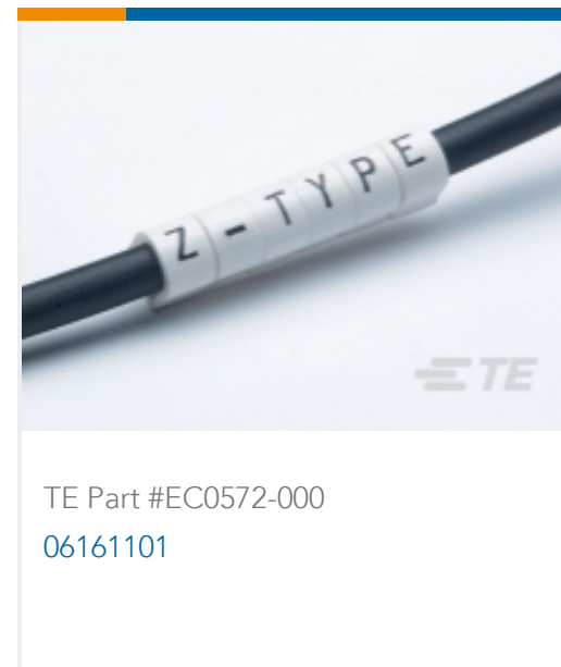
TE Part #EC0572-000 06161101