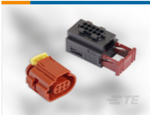
TE Part #144998-6 TIMER, CONNECTOR HOUSING