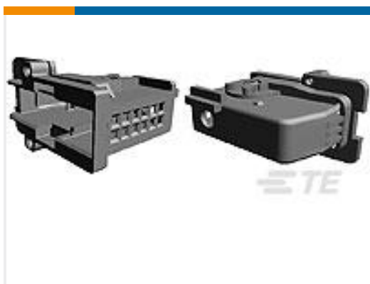
TE Part #1379095-3 COV+LEV MQS 12W 0DEG BLAC