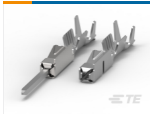
TE Part #968678-2 MQS, RECEPTACLE AND TAB