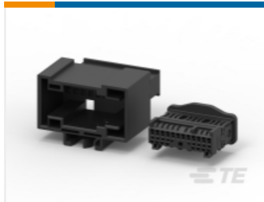
TE Part #1379219-1 MQS, CONNECTOR HOUSING