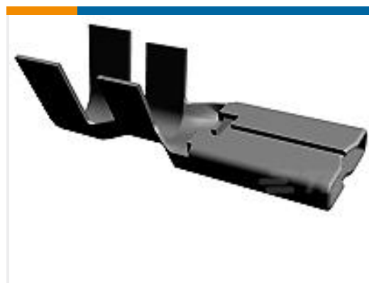
TE Part #1544106-1 CLIPS 8 MM G3 MAXI