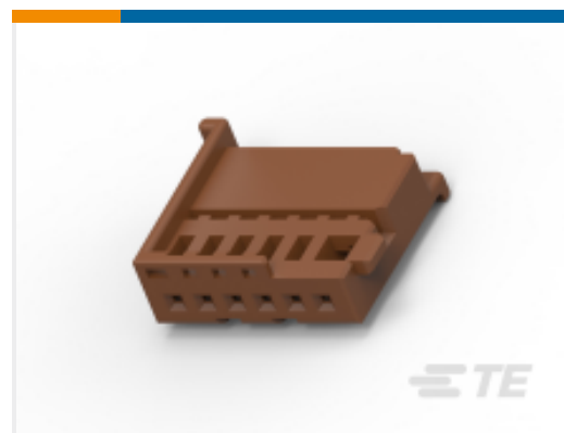
TE Part #1-969489-2 6POS MQS REC COD A