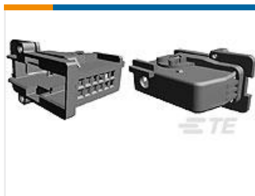
TE Part #1379100-2 COV+LEV MQS 18W 0DEG WHI