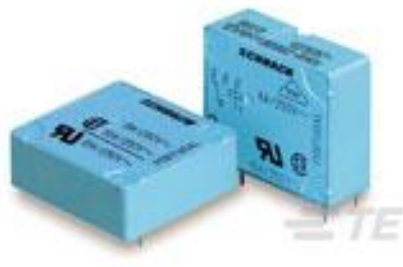
TE Part #1393215-1 V23057-A0001-A101