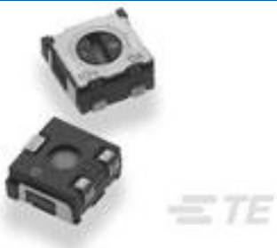
TE Part #1-1623916-1 3203X 50K