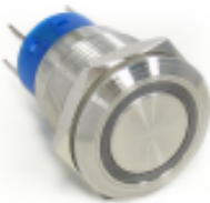
TE Part #1-2213767-5 AV19 SPM 5A MOVE RING LED GREEN 24V