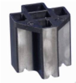
TE Part # 1-1904045-1 V23333Z0001A007-EV-100

This information is provided based on reasonable inquiry of our suppliers and represents our current actual knowledge based on the information they provided. This information is subject to change. The part numbers that TE has identified as EU RoHS compliant have a maximum concentration of 0.1% by weight in homogenous materials for lead, hexavalent chromium, mercury, PBB, PBDE, DBP, BBP, DEHP, DIBP, and 0.01% for cadmium, or qualify for an exemption to these limits as defined in the Annexes of Directive 2011/65/EU (RoHS2). Finished electrical and electronic equipment products will be CE marked as required by Directive 2011/65/EU. Components may not be CE marked. Additionally, the part numbers that TE has identified as EU ELV compliant have a maximum concentration of 0.1% by weight in homogenous materials for lead, hexavalent chromium, and mercury, and 0.01% for cadmium, or qualify for an exemption to these limits as defined in the Annexes of Directive 2000/53/EC (ELV). Regarding the REACH Regulation, the information TE provides on SVHC in articles for this part number is based on the latest European Chemicals Agency (ECHA) ‘Guidance on requirements for substances in articles’ posted at this URL: https://echa.europa.eu/guidance-documents/guidance-on-reach