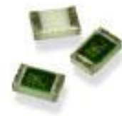
TE Part #1-2176217-5 CPF A 0805 51R 0.1% 25PPM 1K RL