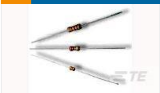
TE Part #1623932-5 CFR50 5% 100K