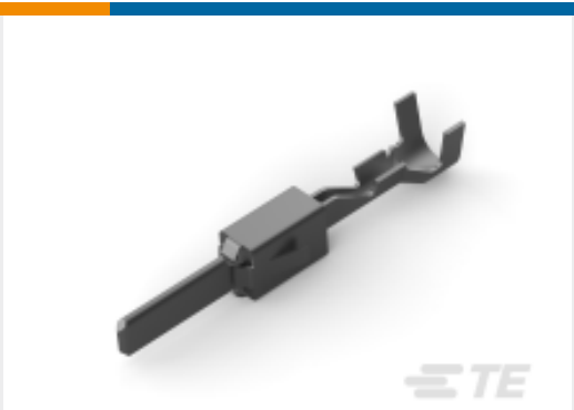
TE Part # 1-965982-1 TAB TAB 0.2-0.5 MM2 0.32X35.0 PTPPHBZ