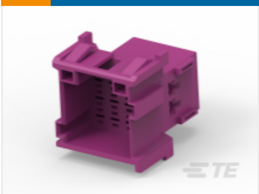
TE Part #1-967627-6 FLACHSTE-GEH2,8 12P