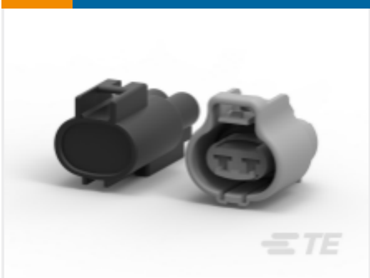
TE Part #1-174357-2 ECONOSEAL, CONNECTOR HOUSING