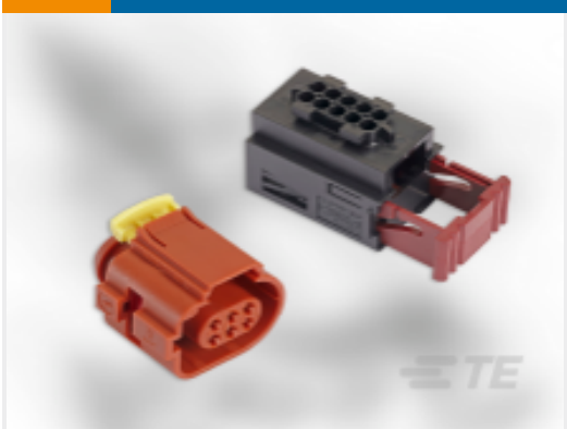
TE Part #1-963212-1 TIMER, CONNECTOR HOUSING