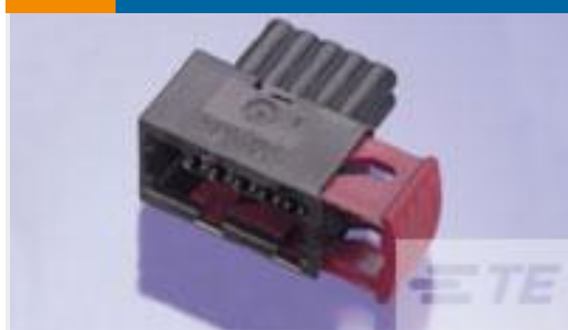
TE Part # 1-963212-9 6P J-P-T GEH KOMPL