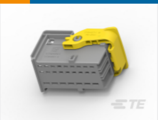
TE Part #1-1718484-4 AMP MCP BACKSHELLS