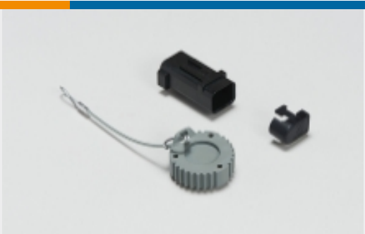
Automotive Connector Caps & Covers (11)