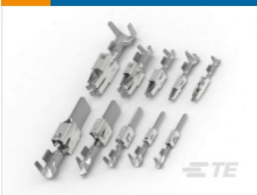
TE Part # CAT-T4827-T273 TIMER, RECEPTACLE AND TAB