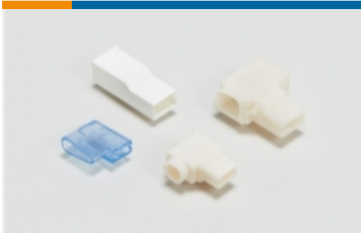
Crimp Terminal Housings(13)