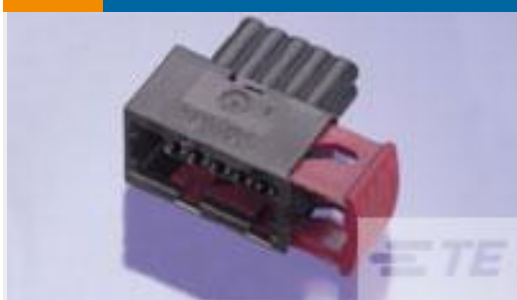
TE Part # 2-1452319-1 JPT HOUSING SEAL 6P