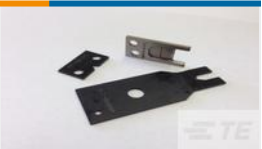
TE Part #1-2217206-3 Blade, Slug