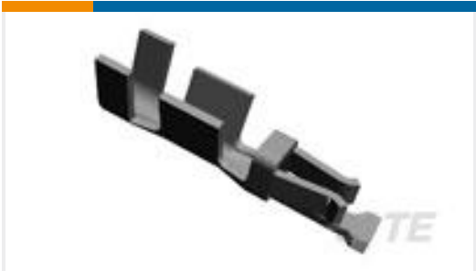
TE Part #969047-3 MODU CRIMP CONTACT