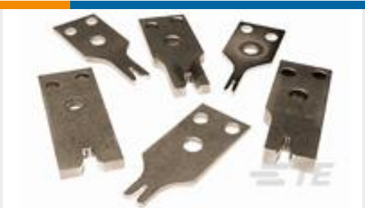
TE Part #1-2119582-1 Crimper, Insulation F Premium