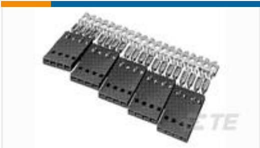
TE Part #103648-2 03 MTE RCPT HSG SR RIB .100CL