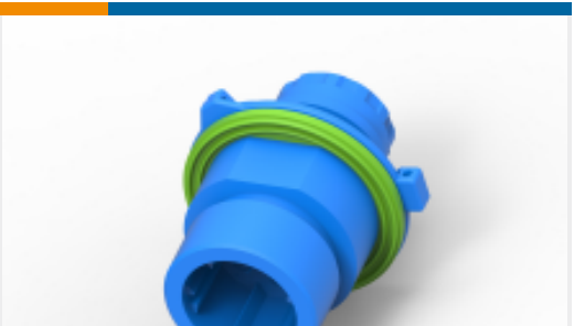
TE Part #1-967325-3 CIRCULAR DIN HOUSINGS