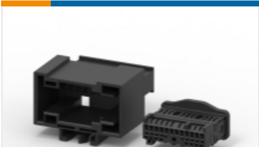
TE Part #1534125-1 MQS, CONNECTOR HOUSING