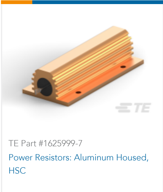
TE Part #1625999-7 Power Resistors: Aluminum Housed, HSC