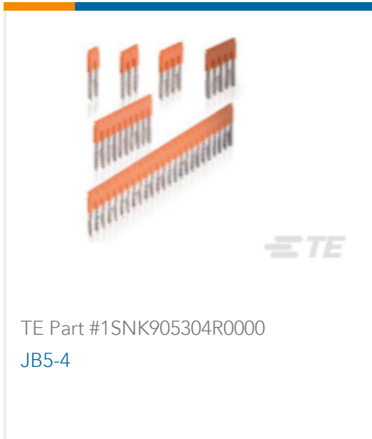
TE Part #1SNK905304R0000 JB5-4