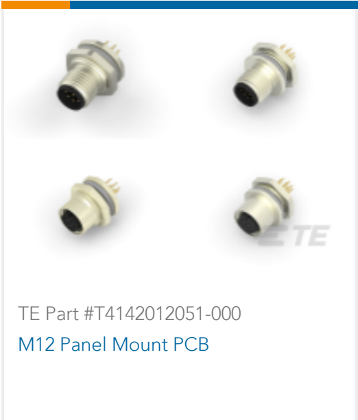
TE Part #T4142012051-000 M12 Panel Mount PCB