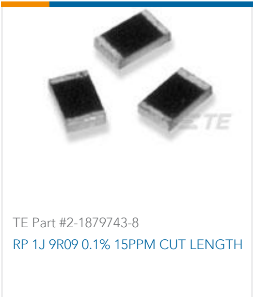
TE Part #2-1879743-8 RP 1J 9R09 0.1% 15PPM CUT LENGTH