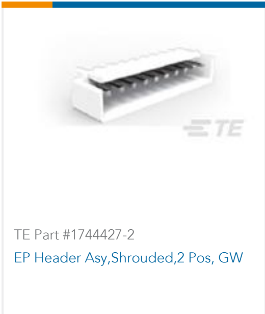
TE Part #1744427-2 EP Header Asy, Shrouded, 2 Pos, GW