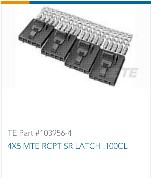
TE Part #103956-4 4X5 MTE RCPT SR LATCH .100CL