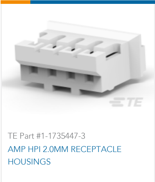
TE Part #1-1735447-3 AMP HPI 2.0MM RECEPTACLE HOUSINGS