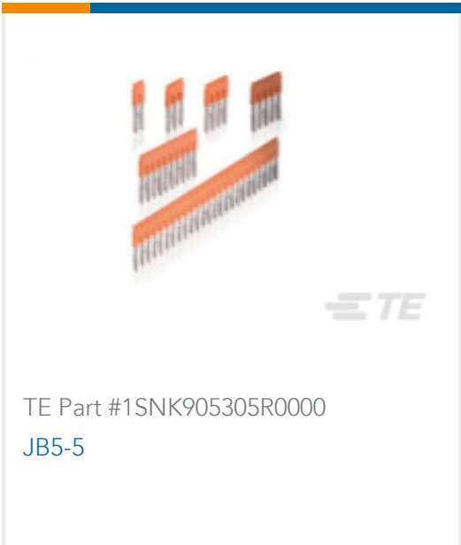
TE Part #1SNK905305R0000 JB5-5