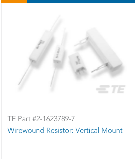
TE Part #2-1623789-7 Wirewound Resistor: Vertical Mount