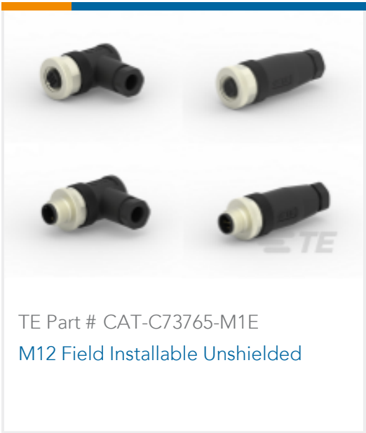
TE Part # CAT-C73765-M1E M12 Field Installable Unshielded