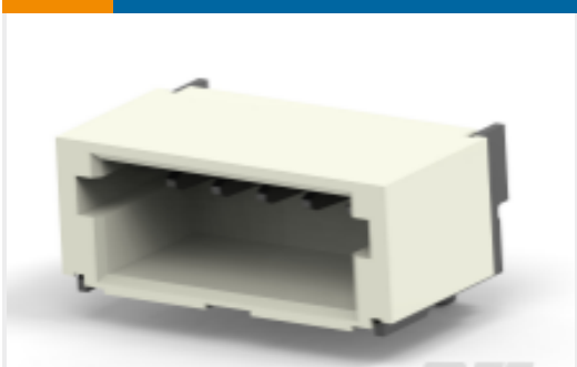
TE Part #1-1734595-2 AMP HPI 1.0MM HEADERS