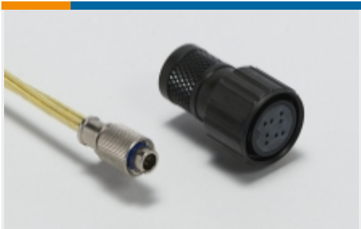
Standard Circular Connectors(453)