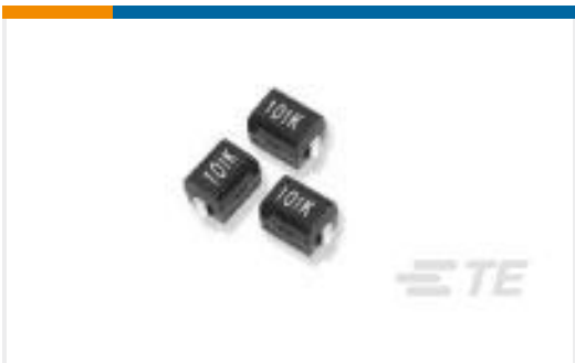
TE Part #1-1624094-9 3613C 5.6UH 10%