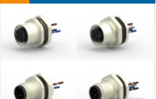
TE Part #T4171320008-001 M12 Panel Mount Wire