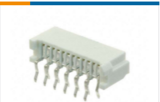
TE Part #1-84534-4 1.25mm FPC Connectors