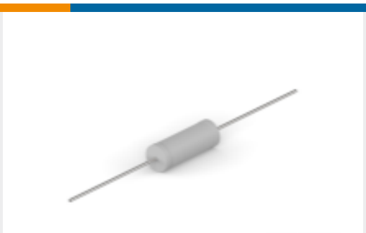
TE Part #1-2176412-9 5W XSM M/OX 5% 30R