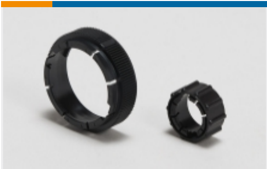
Circular Connector Adapters(2)