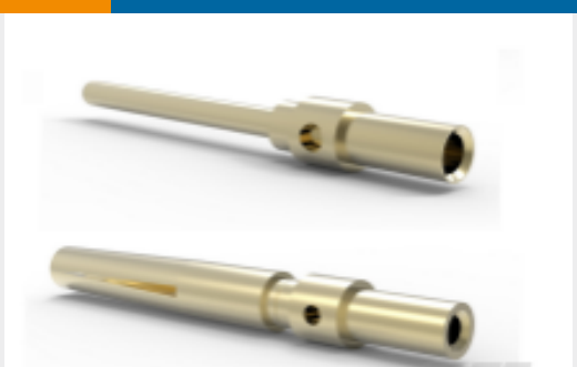
TE Part #1-2314101-2 M12 CRIMP CONTACT FOR A8 CODE