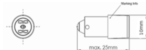
Lamp base in accordance to DIN EN 60061-1: BA9s