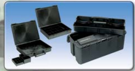
▲ A wide range of mobile ESD products. All stationary products are equipped with earth leads