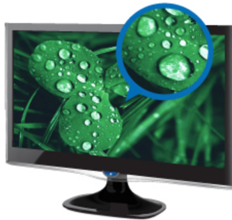
Ultra HD 4K