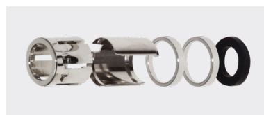
Non IP68 cable clamps also available