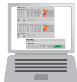
Downloaded HTML Survey Results