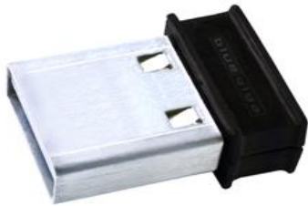
Figure 1: BLED112 Bluetooth Smart USB dongle

BLED112 Bluetooth Smart Dongle integrates all Bluetooth Smart features. The USB dongle can a virtual COM port that enables simple host application development using a simple application programming interface. The BLED112 can be used for Bluetooth Smart development. With two BLED112 dongles you can quickly prototype new Bluetooth Smart application profiles by utilizing Bluegiga Profile Toolkit™ and also automate in module software functions with Bluegiga BGScript™.