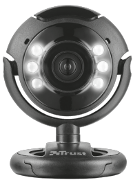
PRODUCT FRONT 1