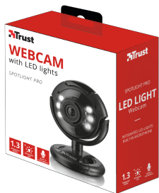
PACKAGE VISUAL 1