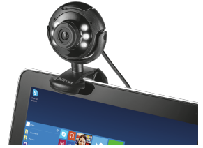
PRODUCT EXTRA 1