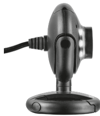
PRODUCT SIDE 1