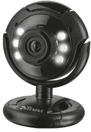
PRODUCT VISUAL 1