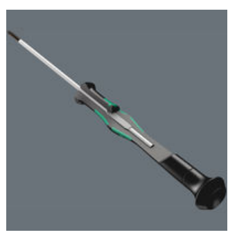
Multi-component screwdriver handle for ergonomic working.