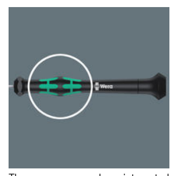
The power zone has integrated soft zones near the blade tip to ensure high torque transfer for loosening or tightening screws without losing contact with the screw.