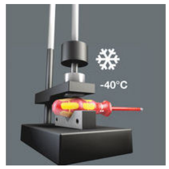
Impact strength tested at -40^{\circ} C, guaranteeing safety even under extreme conditions.