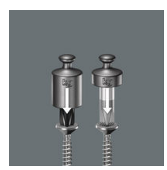
Wera Lasertip reduces the contact pressure required and enhances force transfer – meaning less screwdriving effort is required. Screwdriving becomes safer and easier.