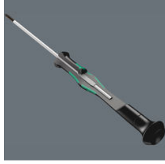
Multi-component screwdriver handle for ergonomic working.