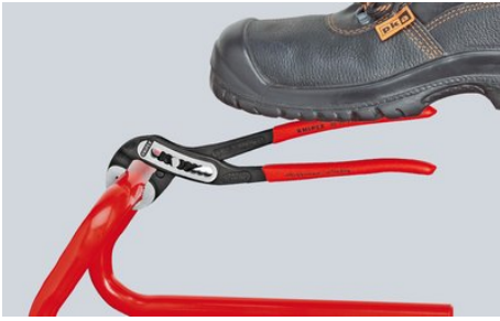
Self-locking on pipes and nuts: no slipping on the workpiece; the complete actuating force can be used to turn the workpieces; not having to squeeze the pliers handles reduces the required effort