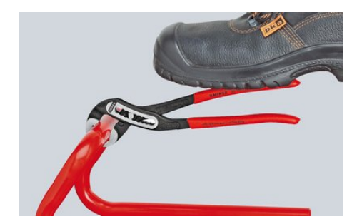
Self-locking on pipes and nuts: no slipping on the workpiece; the complete actuating force can be used to turn the workpieces; not having to squeeze the pliers handles reduces the required effort