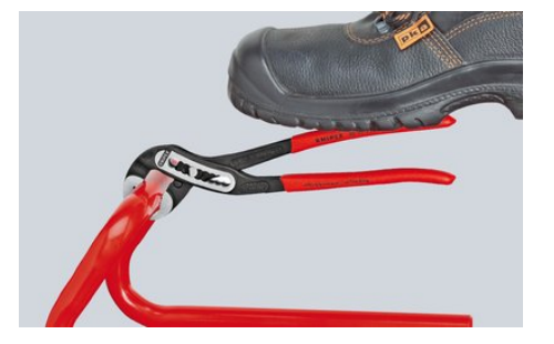
Self-locking on pipes and nuts: no slipping on the workpiece; the complete actuating force can be used to turn the workpieces; not having to squeeze the pliers handles reduces the required effort