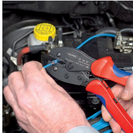
97 52 37