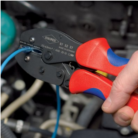
97 52 37