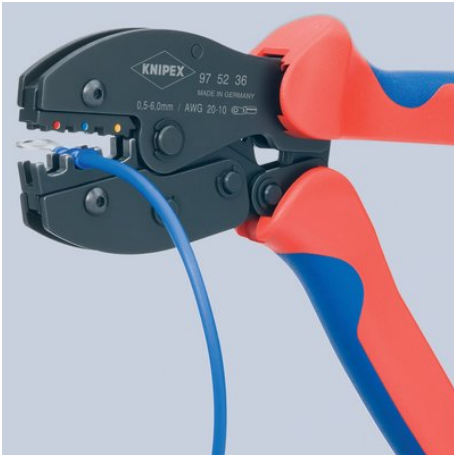
97 52 36