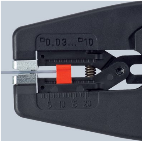
Steel clamping jaws avoid slipping of the cable