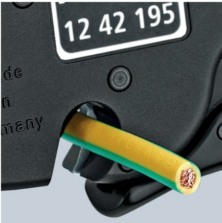
Wire cutter for multiple stranded wire cables up to 10.0 mm 2