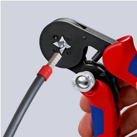
Crimping capacity can be switched over simply from 10 mm 2 to 16 mm 2 .