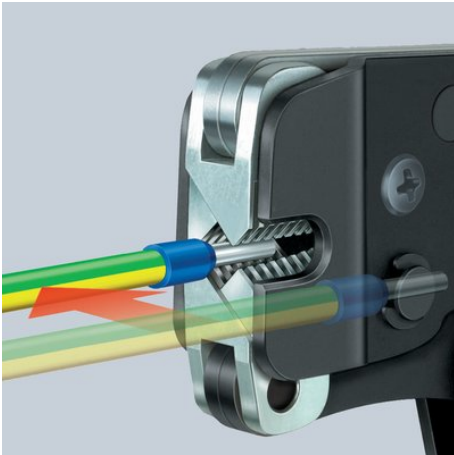
97 53 08: lateral loading of wire ferrules up to 2.5 mm 2 parallelly from the side e.g. in confined areas