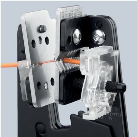
Positive stripping thanks to precise shape of the blades