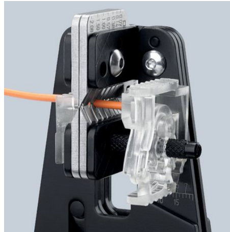
Precise cutting of the insulation to a complete extent