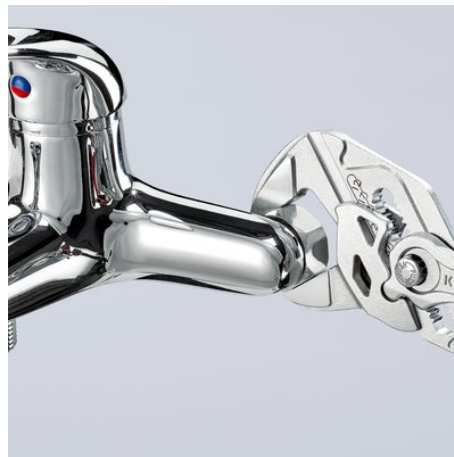
Working on plated fittings without damage of the surface