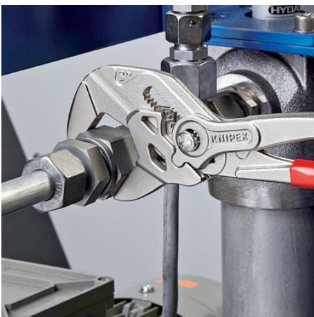
replaces the need for sets of metric and imperial spanners