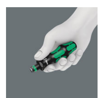
The outstanding design of the Kraftform handle that fits perfectly into the hand prevents hand injuries such as blisters and calluses.

Hexagon screws can endure a problem because the contact surfaces delivering the power from the conventional tool, is transferred to the screw via very small surface areas. The consequence: the screw can become damaged (rounding out). Hex-Plus tools have a greater contact surface that prevents this from happening! At the same time, as much as 20 % more torque can be applied. Good to know: Hex-Plus tools fit into every standard hexagon socket screw!