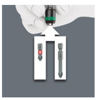
The Rapidaptor quick-release chucks hold 1/4" DIN ISO 1173-C 6,3 and E 6,3 as well as Wera series 1 and 4 bits.