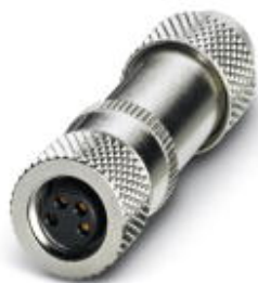
Connector, 4-position, shielded, Socket straight M8, A-coded, Solder connection, knurl material: Nickel-plated brass, external cable diameter 3.5 mm ... 5 mm

Please be informed that the data shown in this PDF Document is generated from our Online Catalog. Please find the complete data in the user's documentation. Our General Terms of Use for Downloads are valid ( http://phoenixcontact.com/download )