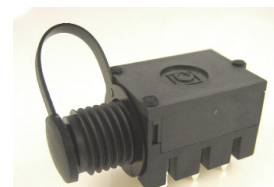
Black socket showing hole plug.

Order as: S1K[ ] / BNB - Mono Type BBB - Stereo