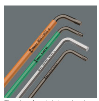
The size of each L-keys has been engraved by a laser. In addition SPKL L-keys have a colour coding according to sizes – for simple and rapid accessing of the required tool. Making it easy to find the right tool.